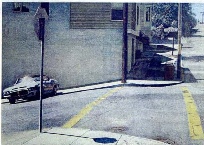
Texas and 20th Intersection, 2004, color soft ground etching with aquatint, 22 by 30 1/4 inches. Courtesy Crown Point Press.

Refreshingly, the paintings do not proclaim their importance or flaunt their intelligence. In an odd twist, Bechtle's overt technical virtuosity provides a cover for his pictorial and conceptual depth: if the paintings are so well painted, so "lifelike," how can they be anything but easy, middle-brow stuff? Of course, letting people underestimate you has tactical advantages. Bechtle grapples with serious issues of representation, but he does so in such a laboriously off-hand way that it takes a while for a viewer to realize what the artist is up to, and just how good he is. Bechtle has taken on the sorts of problems that artists of all representational stripes are dealing with these days—particularly the transmutation of the photographic image—and he has, over a span of 40-odd years, come up with real answers. He has proven himself to be a first-rate painter, draftsman and printmaker, and as these recent shows make clear, someone to whom we should pay serious attention. □