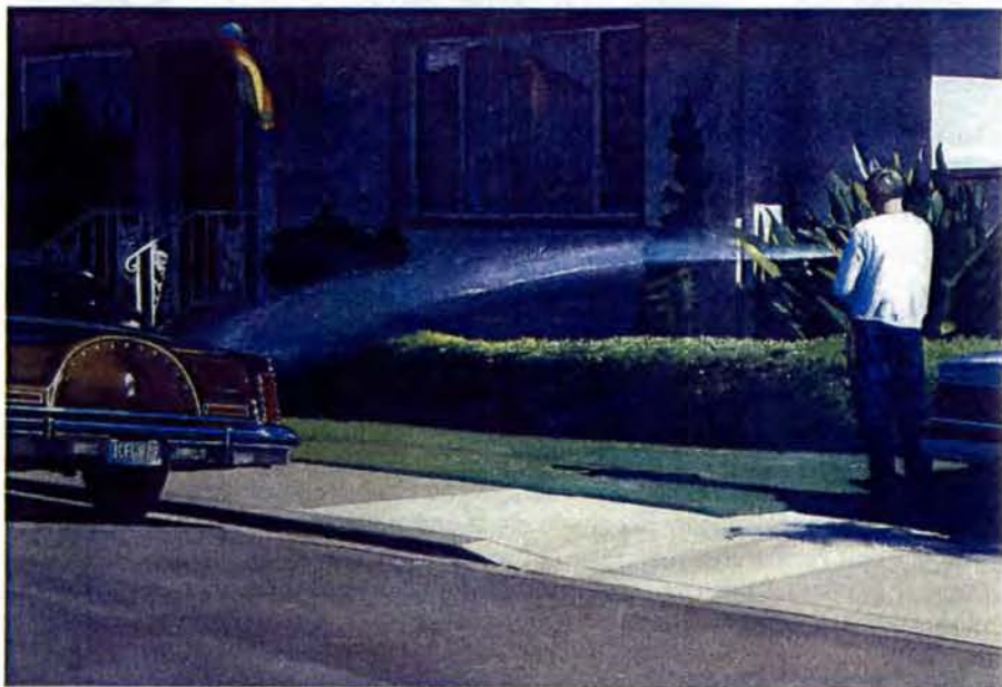
Watering on Sterling Avenue, 1994, watercolor on paper, 15 1/4 by 22 1/4 inches. Collection Jeanne Newman.

however, are paintings, and detail, while captured immediately and mechanically in the source photograph, is not treated that way in the end product. A photographer, no matter how engaged, stands at a remove from the complexity of the subject photographed: a scene is framed, the best image chosen and the picture is developed and printed. While a photographer pays attention to the elements of the photograph, it is not with the same point-to-point intensity brought to bear by a painter transcribing that photograph. That concentration on specifics and away from the iconic tends to mute emotions, especially when the subject matter is ostensibly neutral. Bechtle's paintings are damped down both emotionally and formally, and, while immediately comprehensible on one level, they tend to reveal themselves slowly, even a bit reluctantly.