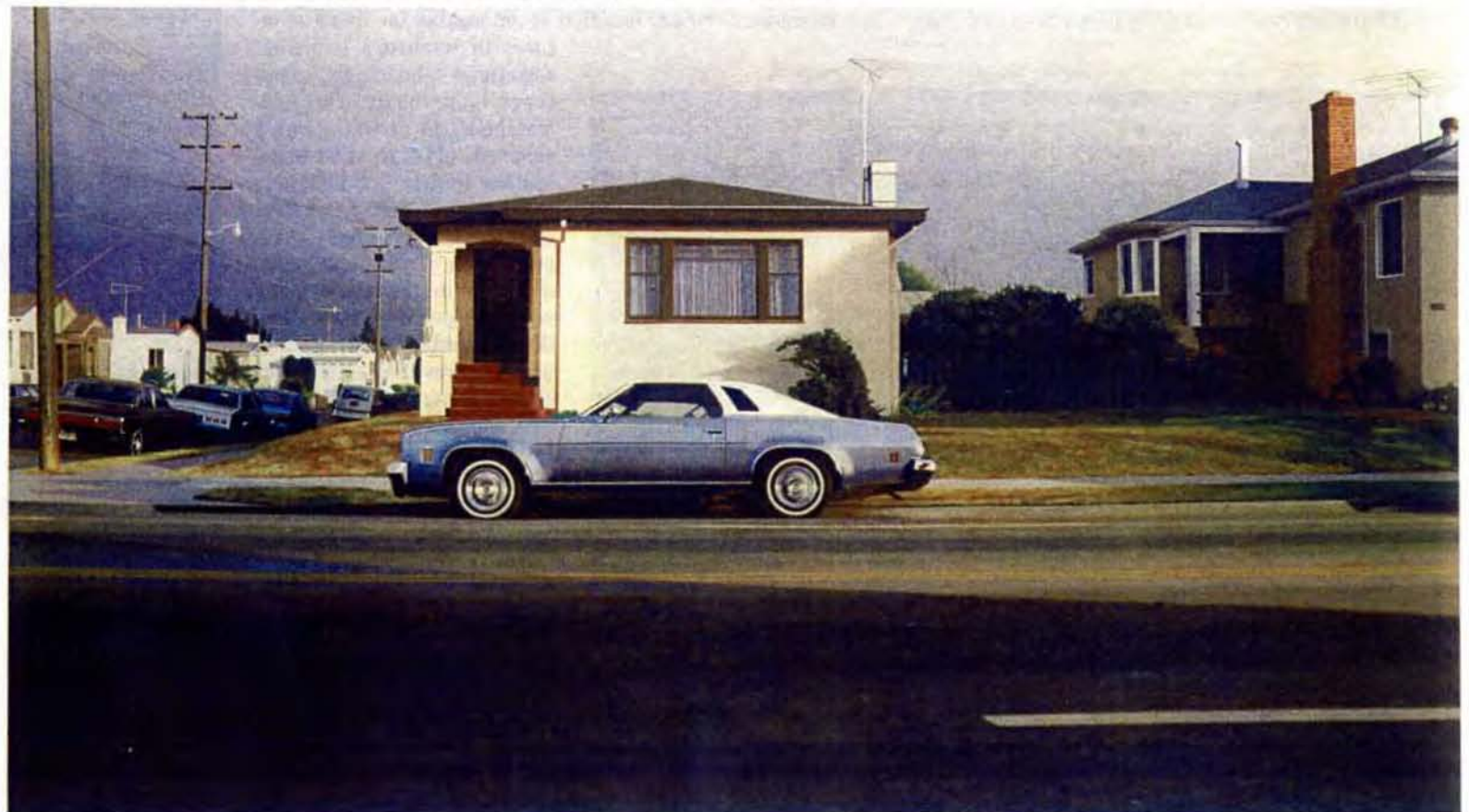
Marin Avenue—Late Afternoon, 1998, oil on canvas, 36 by 66 inches. Private collection, Atlanta.

The objectivity of a photograph is a convention, and one decreasingly serviceable in a world of widespread digital manipulation. Since painting, however, has traditionally bent observed reality to its own expressive and interpretive purposes, the use of a photograph as an ostensibly undistorted painting model allows the artist to tap into the aura of veracity that photographs are still sometimes presumed to have. Needless to say, putting a lens (of any focal length) between the artist and the subject to be painted invariably changes the look of that painting. The camera distorts, but it distorts in a different way than drawing or painting from life does. No matter how skilled an artist you are, and how intent you are on transcribing what you see, the act of