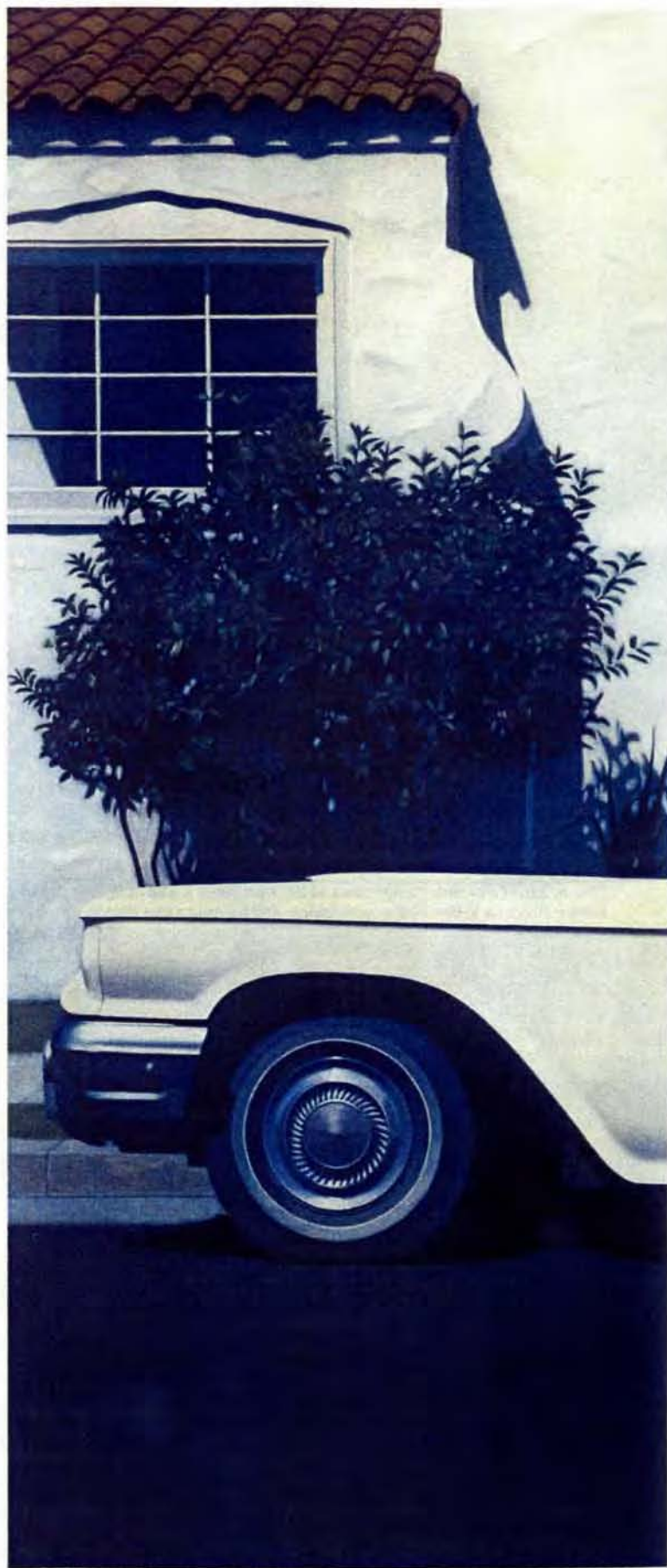
Robert Bechtle: '60 T-Bird, 1967-68, oil on canvas, 72 by 98 1/2 inches. University

Photo-Realism, as Bechtle practices it, seems straightforward. It is presentational, emotionally understated and stylistically neutral, with no mysteries, politics or painterly flourishes readily apparent. Bechtle shoots a 35mm slide of a scene from quotidian American life, projects it onto a mid-sized canvas, draws it accurately and renders it with brushes and oil paint in a clear, meticulous way, so that the final product retains the look and feel of the source photograph. Considering the amount of detail inherent in most photographs, it comes as no surprise that it takes months for Bechtle to make a painting. Photo-Realists have used various techniques to make their work. Malcolm Morley in his early paintings, for example, would grid the canvas, turn it upside down and paint the image in, square by square. (He has recently returned to this style in his paintings of catastrophes and sporting events.) Others combine source photographs to create a working image. Bechtle keeps it simple. He shoots a slide, crops it and uses what he sees, subject to the occasional deletion or minor rearrangement. Bechtle shepherds his painting along in clear, layered stages. He draws the projected image, turns the lights back on and slowly brings the painting up from a monochrome to a colored underpainting. He