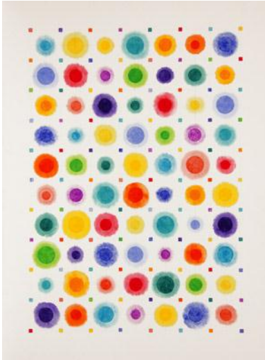
Spectrum Shift, 2011