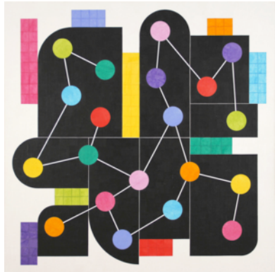
Utilion 2, 2015, 48 x 48", collage, acrylic, flashe on linen