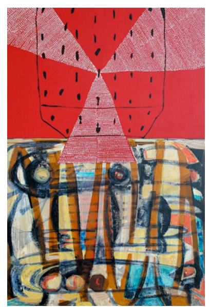
Roy Dowell, Untitled #1083, 2015