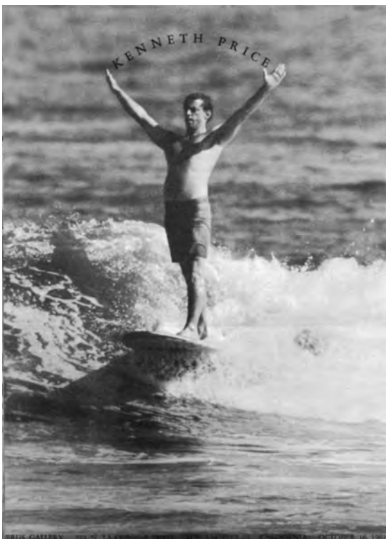
Announcement card for Ken Price's 1961 show at Ferus Gallery.