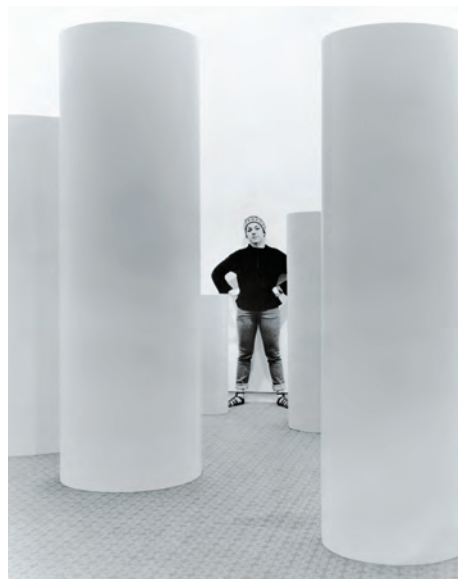
Judy Chicago with her sculpture 10 Part Cylinders, 1966.

explores the increasingly uncloseted gay scene that centered around the English transplants David Hockney and writer Christopher Isherwood, as well as Isherwood's partner, the portraitist Don Bachardy. She gives due coverage as well to the art that sprang from the political ferment of the 1965 Los Angeles riots and the art community's early opposition to the Vietnam War.