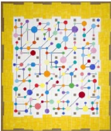
During and After , 2013