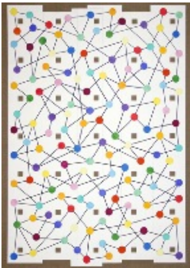
Neochrome , 2013