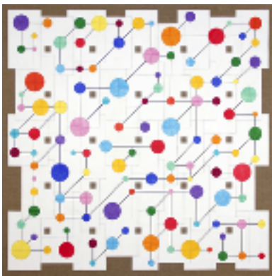
Nominal Space , 2012

Gallery hours: Tuesday-Saturday 10am – 6pm